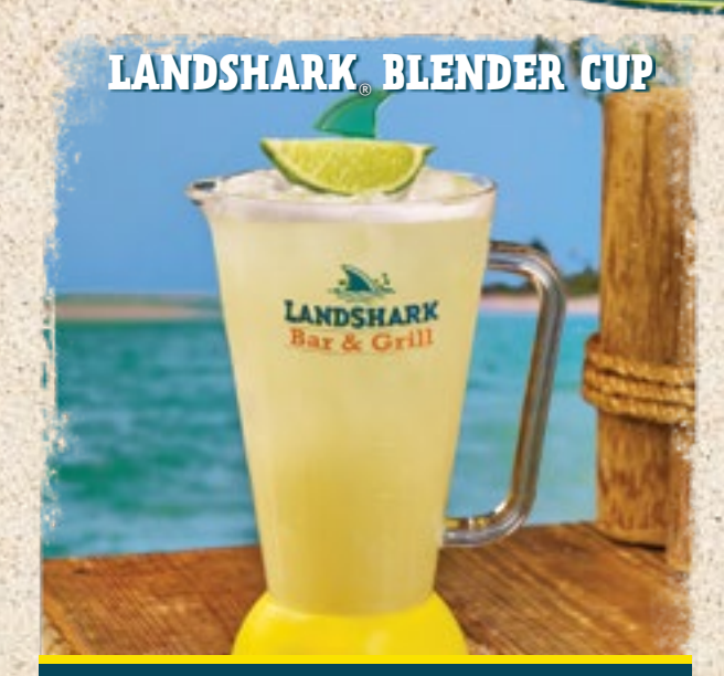
ENJOY YOUR SPECIALTY DRINK OR DRAFT BEER IN A 22 OZ TAKE-HOME LANDSHARK® SOUVENIR BLENDER CUP FOR AN ADDITIONAL $8